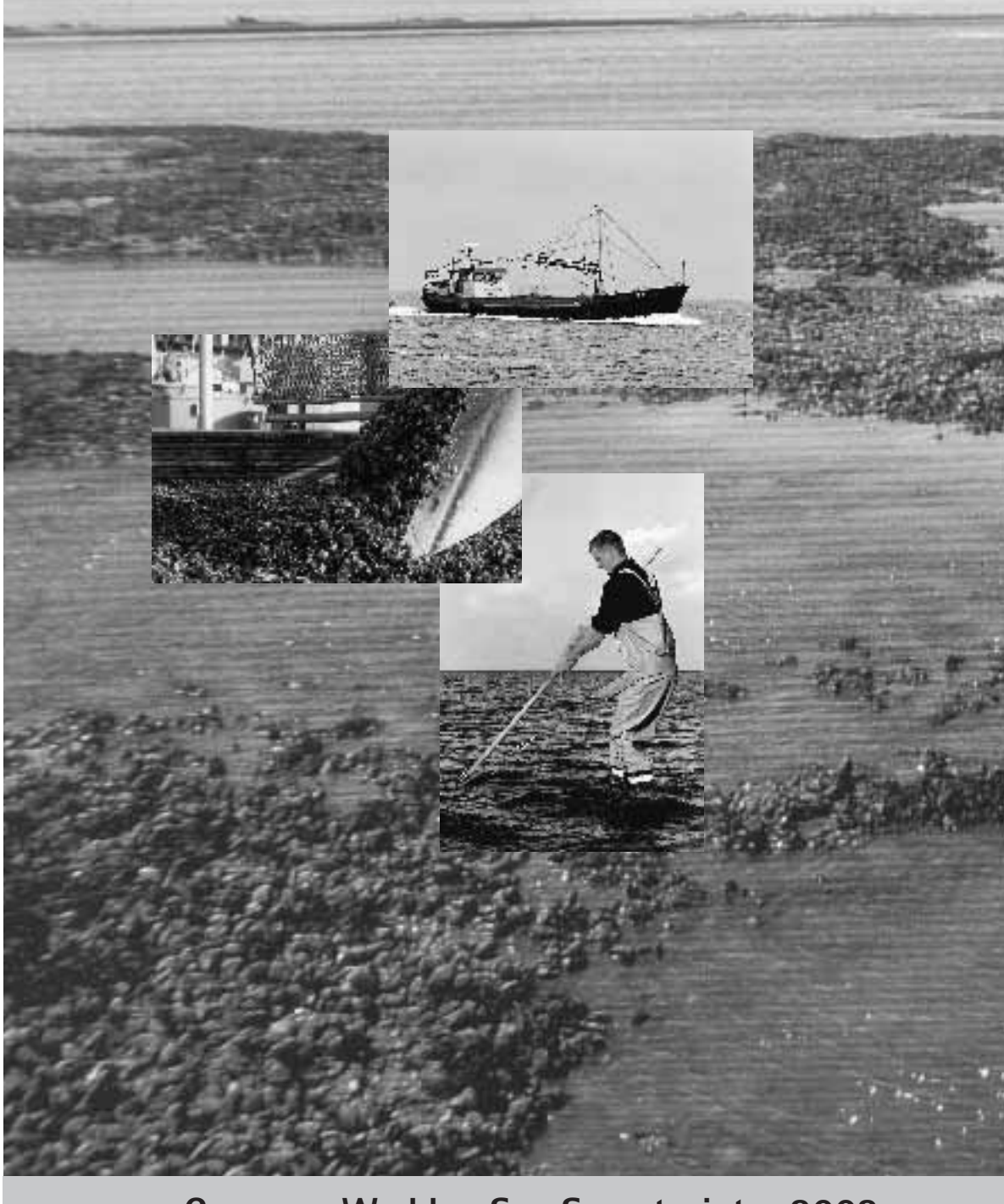
Common Wadden Sea Secretariat - 2002

An Overview of Policies for Shellfish Fishing in the Wadden Sea