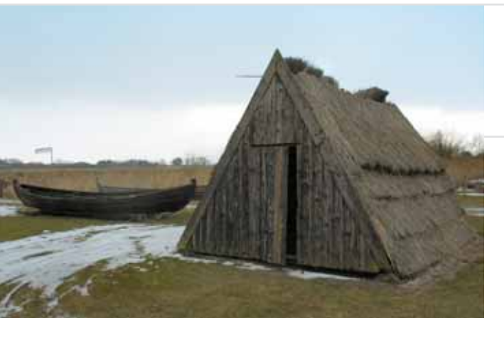
Fisher hut near Højer, Tønder marsh. Denmark