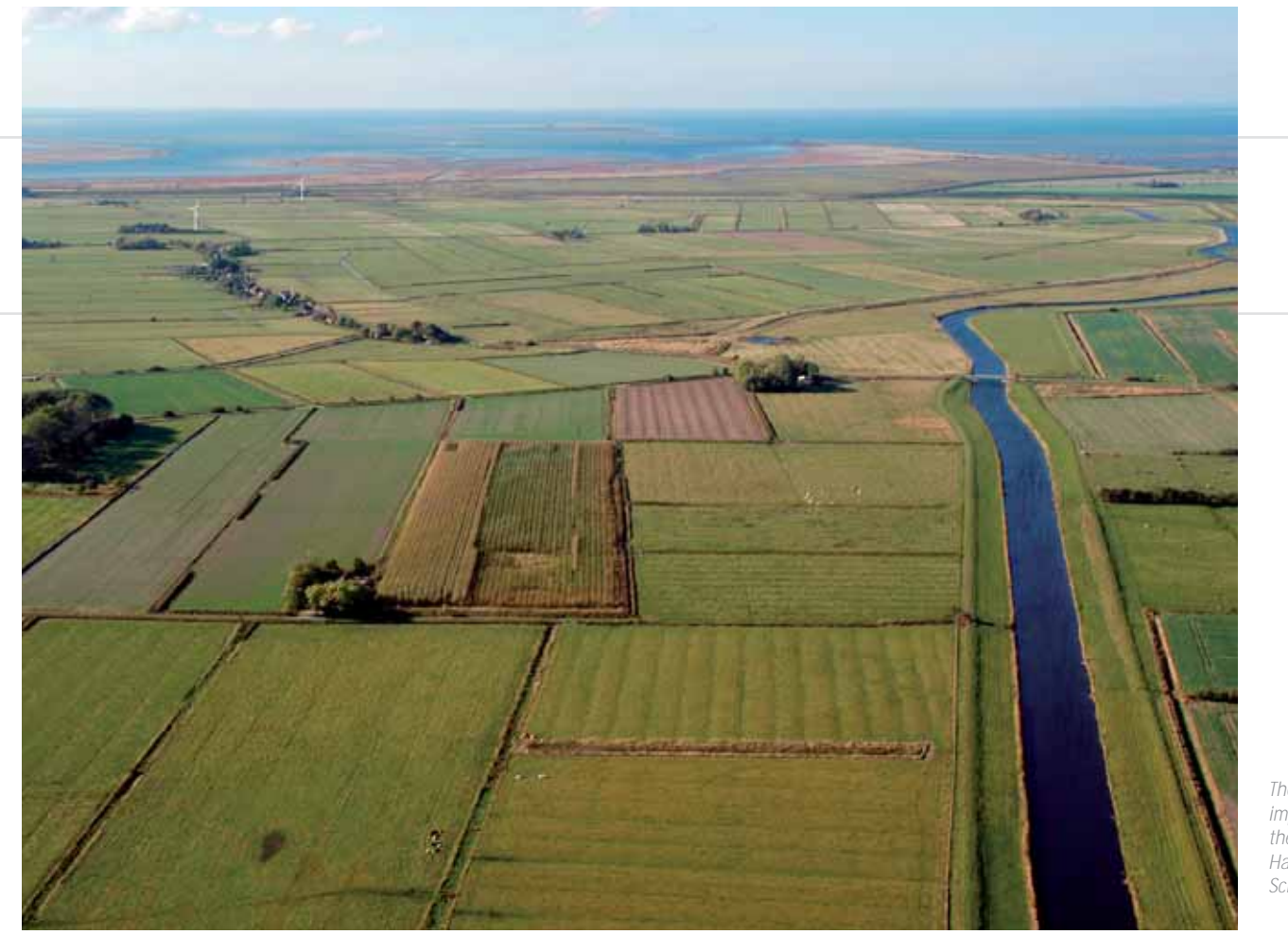
The picture gives an impressive view on the diversity of the Hattstedtermarsch in Schleswig-Holstein

Wadcult should (continue to) be composed of representatives of the competent authorities in the three countries.