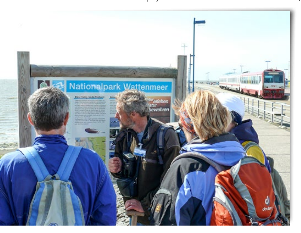
A World Heritage Trust Fund could help finance, among others, visitor information and visitor management.

exact purpose of the foundation are still rather unclear. However, it seems probable that the tourism sector is among those who should (and hopefully also wants to) contribute to the foundation.